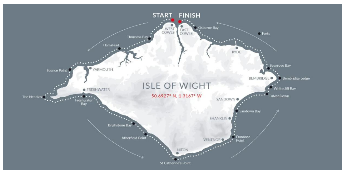
Figure 1 - Round the Island Race Course