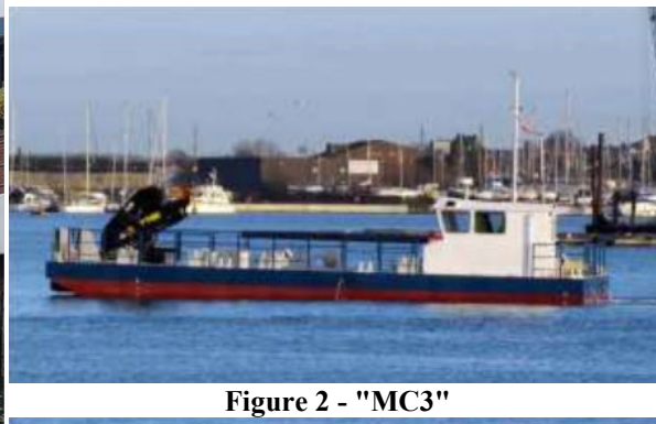
Figure 2 - "MC3"