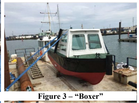
Figure 3 - "Boxer"

This notice will be self-canceling on completion.