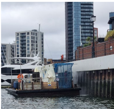
Figure 1 - "Spud Barge"

The above works will all be carried out from marine plant located alongside the structures. With a 12m spud barge workboat 'MC3' and 'Boxer'.