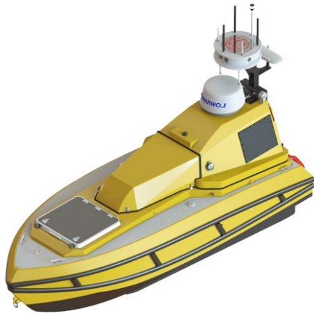
Figure 3 C-Worker