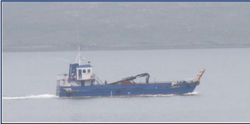
MV Yorkshire Lady

All mariners are requested to keep a good lookout and pass well clear of operation. If this is not possible for navigational safety reasons, then the 'Yorkshire Lady' can be contacted on VHF channel 12 to arrange safe passing.