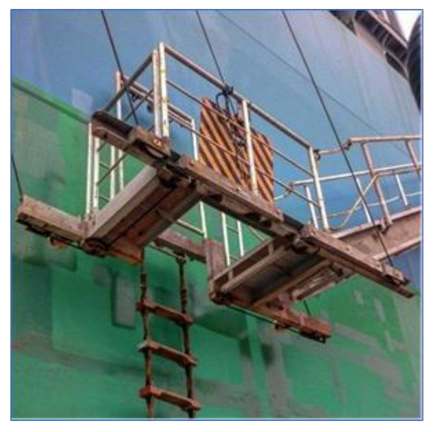
Fig 1: Non-compliant Arrangement

The relevant documents are SOLAS V Regulation 23, IMO Resolution A. 1045 (27) and guidance from Embarkation & Disembarkation of Pilots Code of Safe Practice.